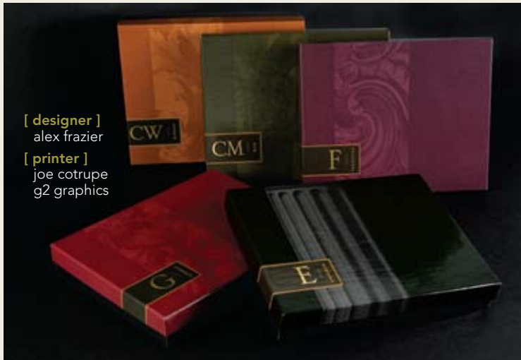
[ designer ] alex frazier [ printer ] joe cotrupe g2 graphics